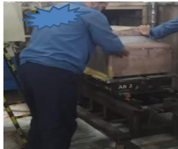
Figure 3- The Jobs and Their Processing Time

The Table 3 shows the jobs and their processing time. Applying job scheduling heuristics to the list of activities described in the precedence graph, we get the critical path: