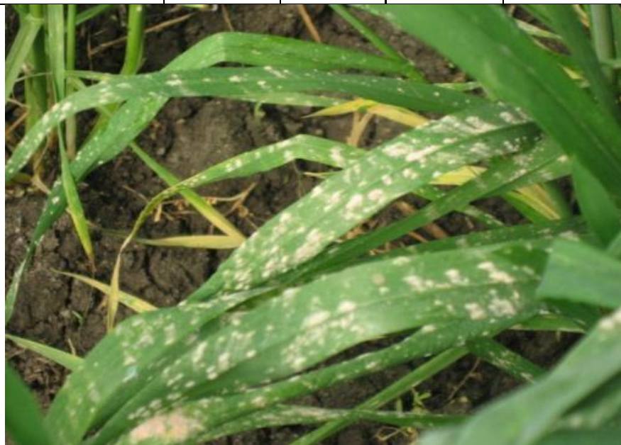
Fig.3 : illustrate severe infection of powdery mildew on experimental plants in 2010 growing season.