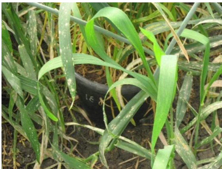
Fig. 2: Illustrate infected plants grown in pots used for inoculation inside the plot plants of the tested cultivar.