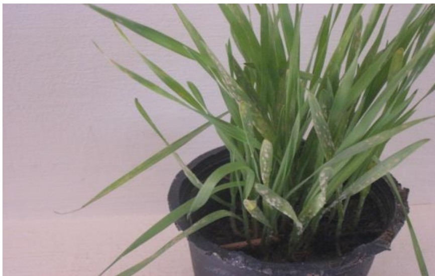
Fig.1: Conidia of powdery mildew multiplied on durum wheat plants under greenhouse conditions.