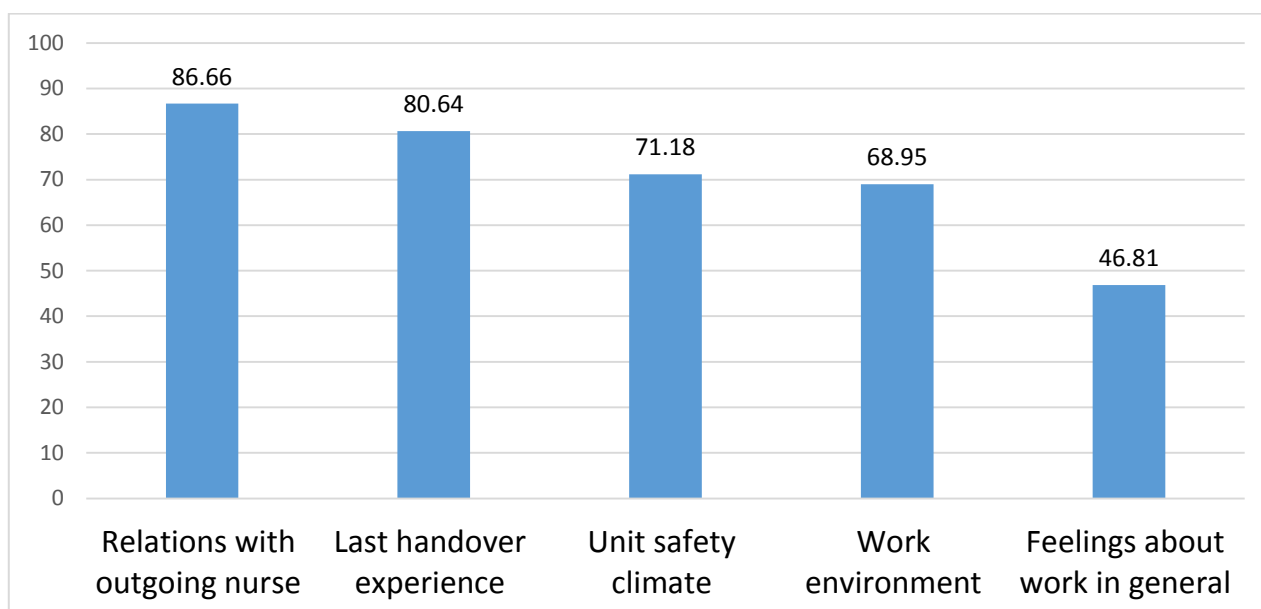
Figure (1): Mean percent of ICU staff nurses' perception regarding factors affecting quality of nursing handover process (n=255)