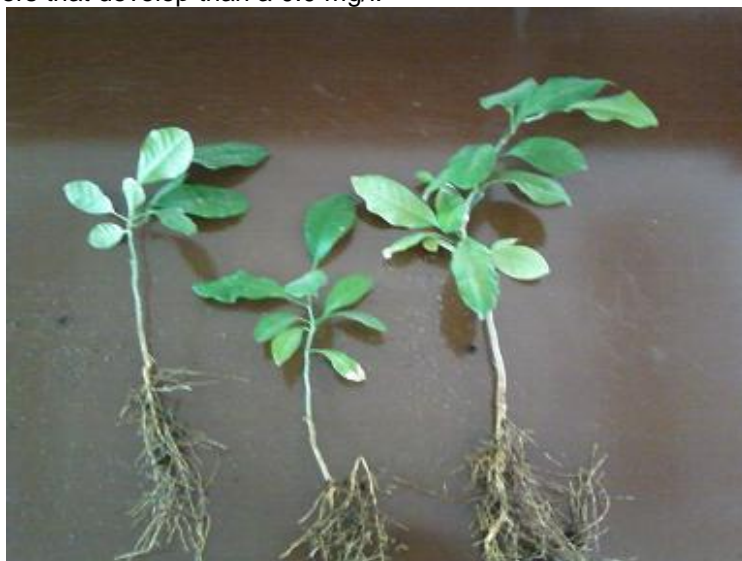
Fig. 2. A normal complete plant differentiation from anther-derived calluses of Citrus volkameriana

Silver nitrate concentrations had a strong influence on percentages of anthers that did not develop where a 2.0 mg/l gave a significantly higher percentages of anthers that develop than a 0.0 mg/l.