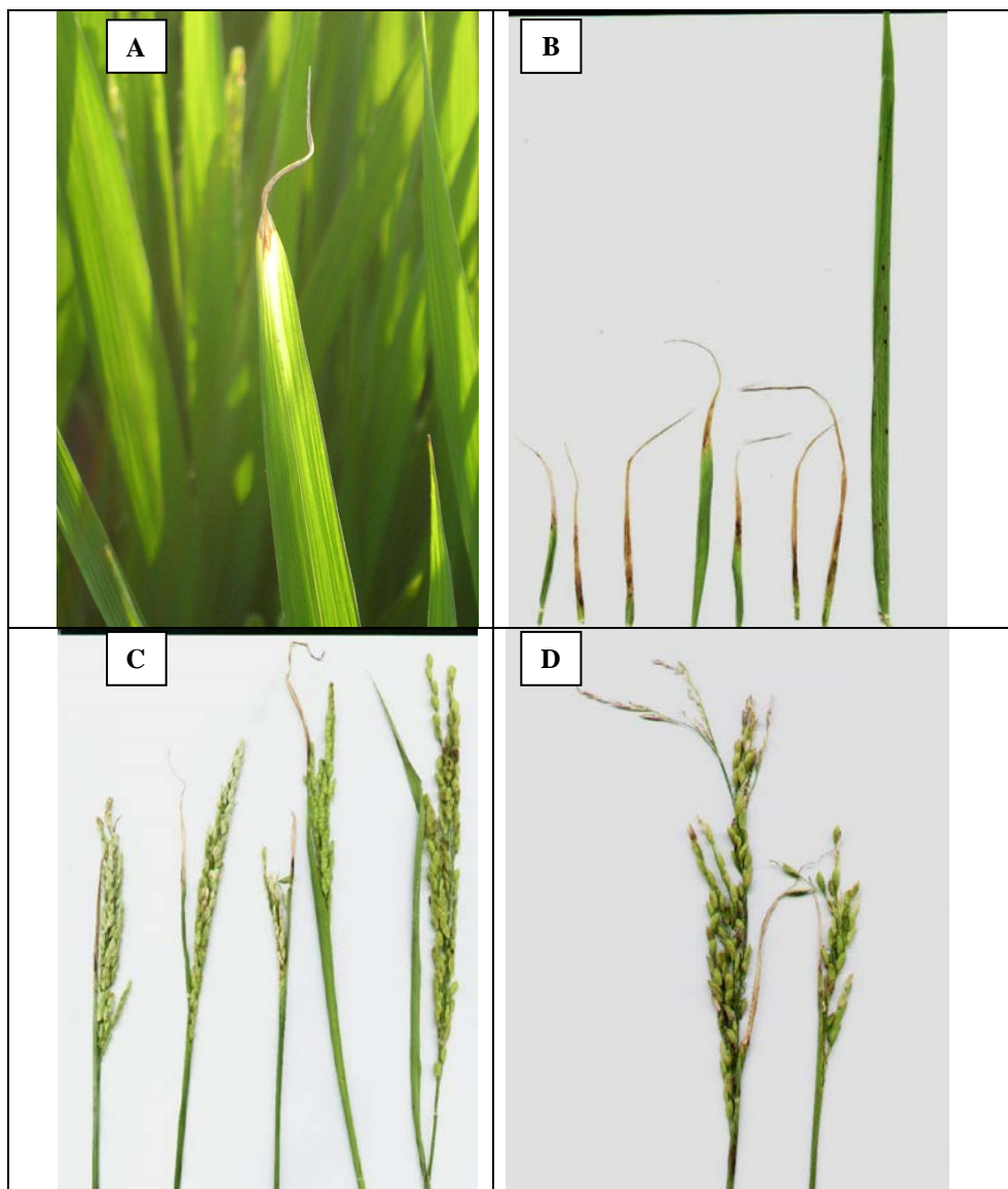
Fig. (1): A, Chlorosis and whitening of flag leaf tip due to white tip nematode B, Damage of flag leaf area and deformation due to white tip nematode C, Deformation and incomplete panicle exertion, twisting and necrotic area of flag leaf D, Panicle branches degeneration and sterility of spiketes,