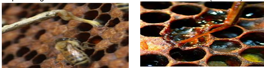
Fig. 1: Table from Shimanuki and Knox (2000) and Delaplane (1998), Roney length from American foulbrood..

However, the discriminative features of the disease were clear in the inspected governorates with variable rates as shown in (Table 3).