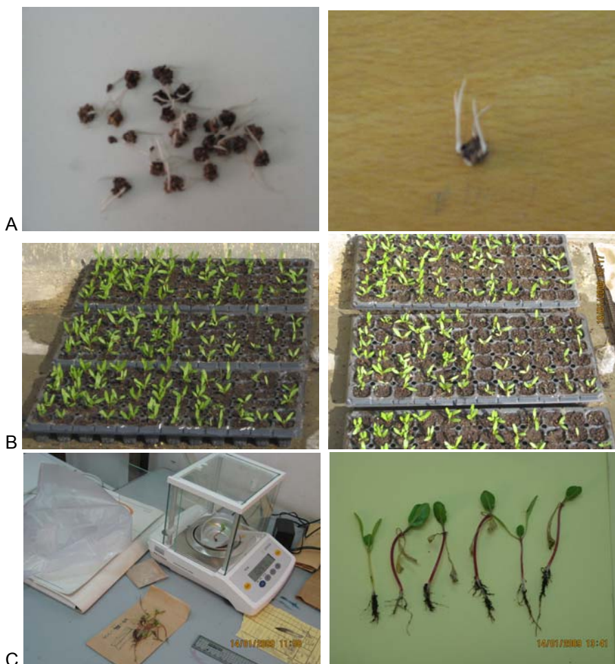
Fig.(2): Seed germination (a) in Petri dishes, (b) in germination trays and (c) seedling weight.