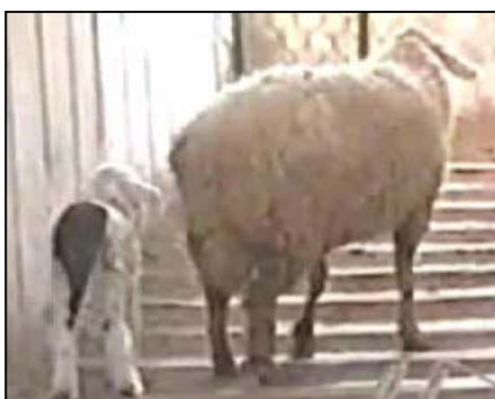
(f): Blackened rump with tail of lamb.