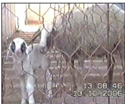
(e): Blackened around eyes of lamb.