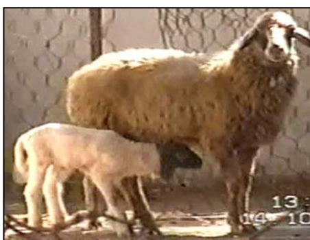
(d): Blackened head of lamb.