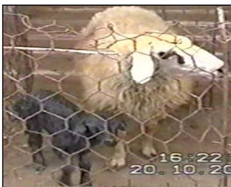
(b): Blackened whole body of lamb.