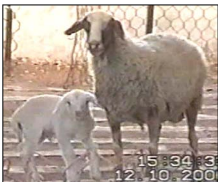
(a): Control unblackened lamb.