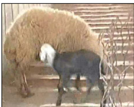
(c): Blackened whole body except head of lamb.