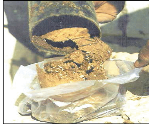
Fig. (3): P.V.C Trap after being buried into soil for 2 weeks