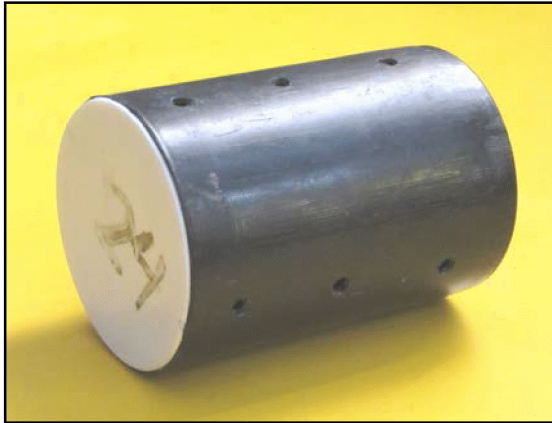
Fig. (2): Trap ready for use